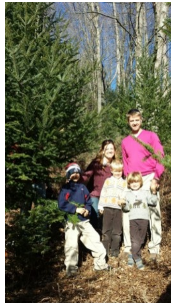
December, 2015 Tree Sale

http://payments.lawpay.com/bpl/lp2525952