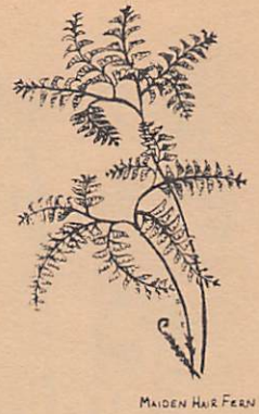
MAIDEN HAIR FERN